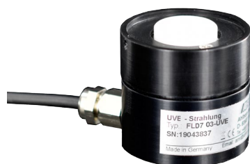
ALMEMO® UVE-measuring head

For connection to current measuring instruments ALMEMO® V7 : ALMEMO® 500, 710, 809, 202, 204