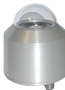
Version in weatherproof housing for outdoor use FLD7 33-UVE Data sheet see chapter meteorology