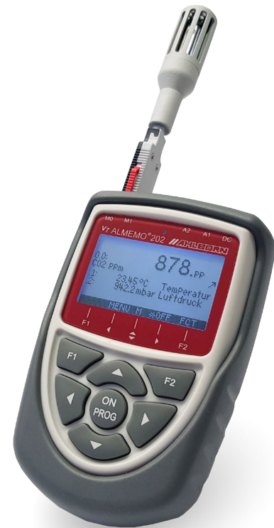
ALMEMO® measuring system (example): CO 2 sensor with data logger ALMEMO® 202/204