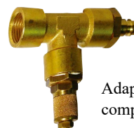
Adapter for compressed air pipes