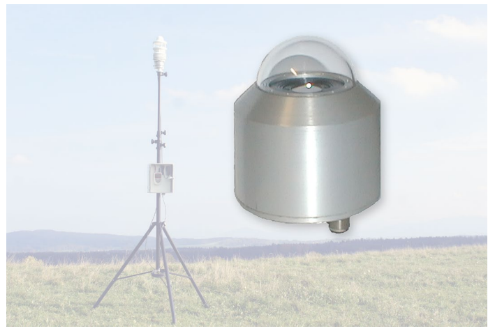
ALMEMO® UVE-measuring head in a weatherproof housing for outdoor use, FLD7 33-UVE

Monitoring of UVE-radiation hazardous for human skin. Stationary measurements in meteorological applications. Supplement to the weather station FMD7 60. For connection to current measuring instruments ALMEMO® V7: ALMEMO® 500, 710, 809, 202-S, 204