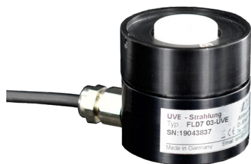
ALMEMO® UVE-measuring head

For connection to current measuring instruments ALMEMO® V7 : ALMEMO® 500, 710, 809, 202-S, 204