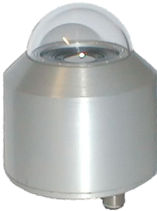
Version in weatherproof housing for outdoor use FLD7 33-UVE Data sheet see chapter meteorology

Digital measuring head for UVE radiation, for measurements in dry surroundings. Sensor with permanently attached cable, 1,5 m, with ALMEMO® D7-connector