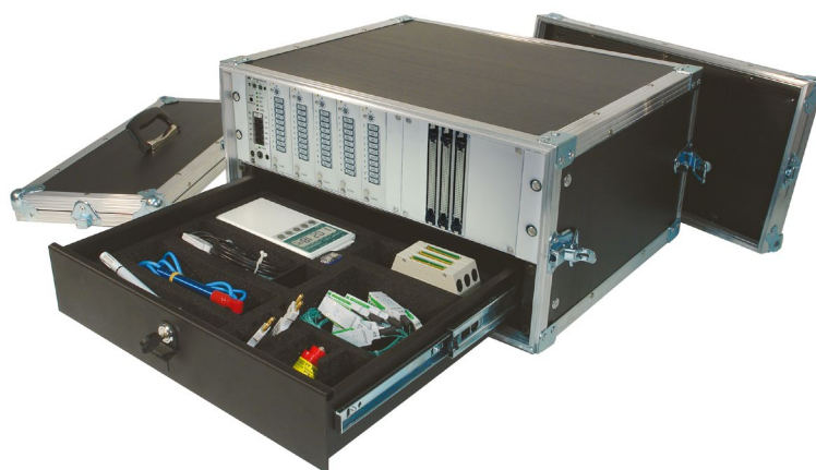
Rack case with handle ZB5090RC for ALMEMO® 5690-xxBT8 in 19-inch rack housing