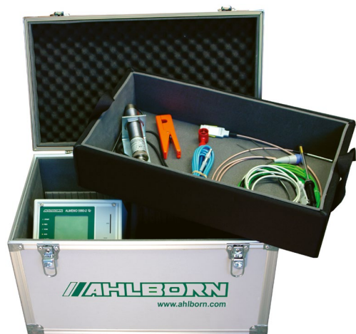
Carry case, aluminum profile frame ZB5600TK3 for ALMEMO® 5690-1/ -2

Data acquisition system in 19-inch rack housing CPU board, 19 free slots MA56901CPUBT8 Measuring inputs via nine A10 or TH2 boards (90 inputs) or 19 MU boards (190 inputs) or four RTA5 output boards