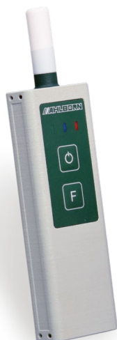
FH 1746-1C4 / HT