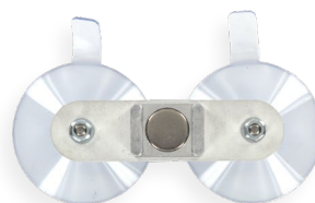
Suction cup fastening